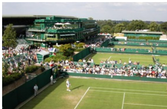
No matter the crowd capacity, Cleanevent Is up for the challenge

Cleanevent is committed to the success of the Wimbledon Championships on an ongoing basis. Like the players on the Centre Court, the company strives to improve its performance year after year to deliver an enjoyable tournament for spectators and a successful event for the AELTC.